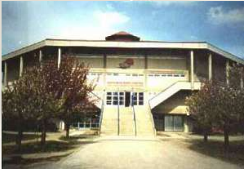
Matsumae Budocenter, Gutheil-Schodergasse 9, 1100 Wien, Austria